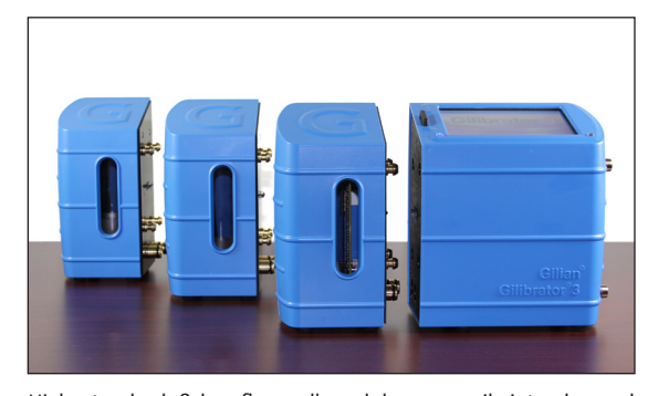
High, standard, & low flow cell modules are easily interchanged

The Gilibrator 3 can be configured to meet the user's calibration needs. The user may select between Continuous or Averaging modes. In Averaging mode, the user may select a sample set between 3 and 20 samples to be averaged. In addition, the user can define statistical parameters for Standard Deviation and percent deviation between sample sets. Within the settings screen, the user is able to define engineering units of measurement, date, time, temperature, and choose from a selection of languages in the devices library.